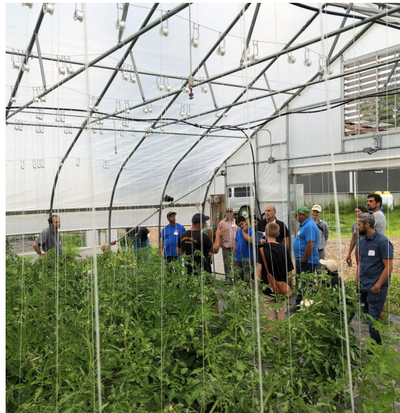
A water management workshop at Kitchen Garden Farm, Sunderland

Farmers can withstand ever-changing conditions.