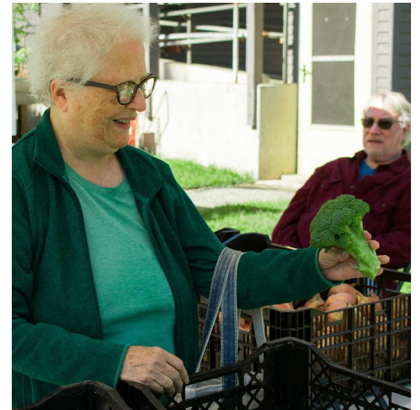
Senior Farm Share pick-up at the Montague Senior Center.

Everyone can afford and enjoy locally grown food throughout the year.