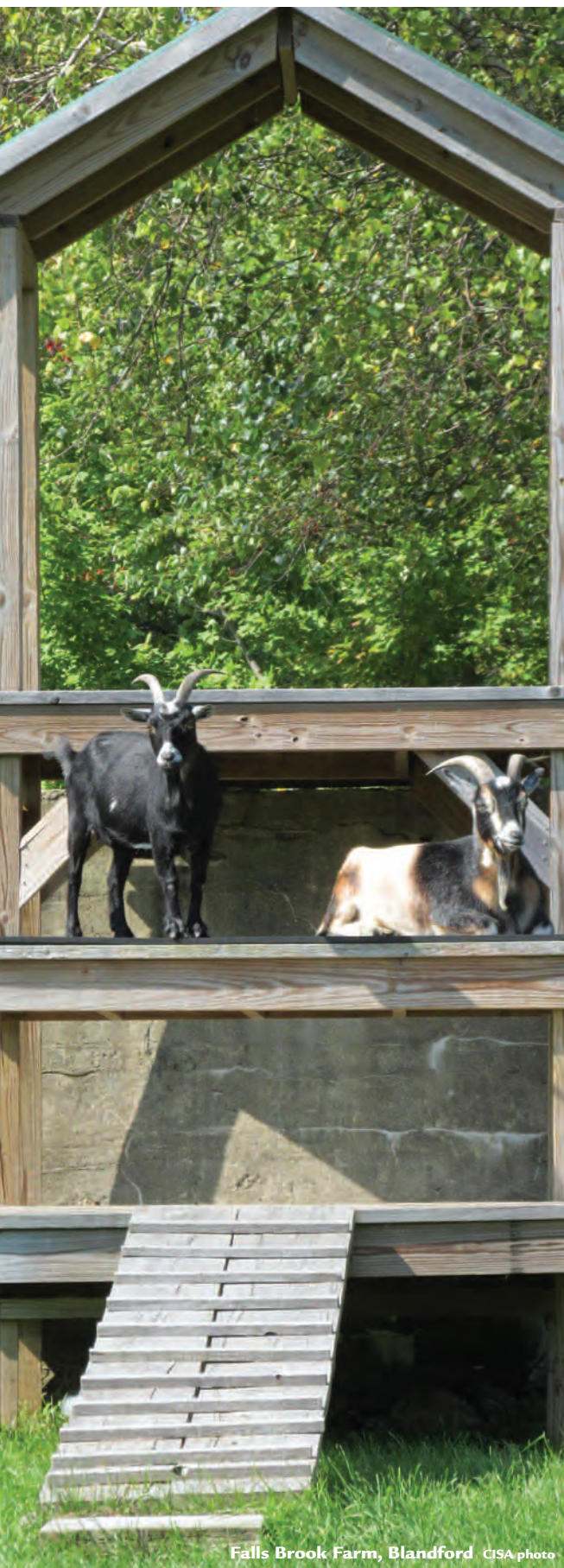
Falls Brook Farm, Blandford