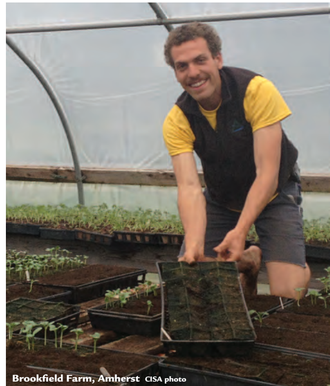
Brookfield Farm, Amherst