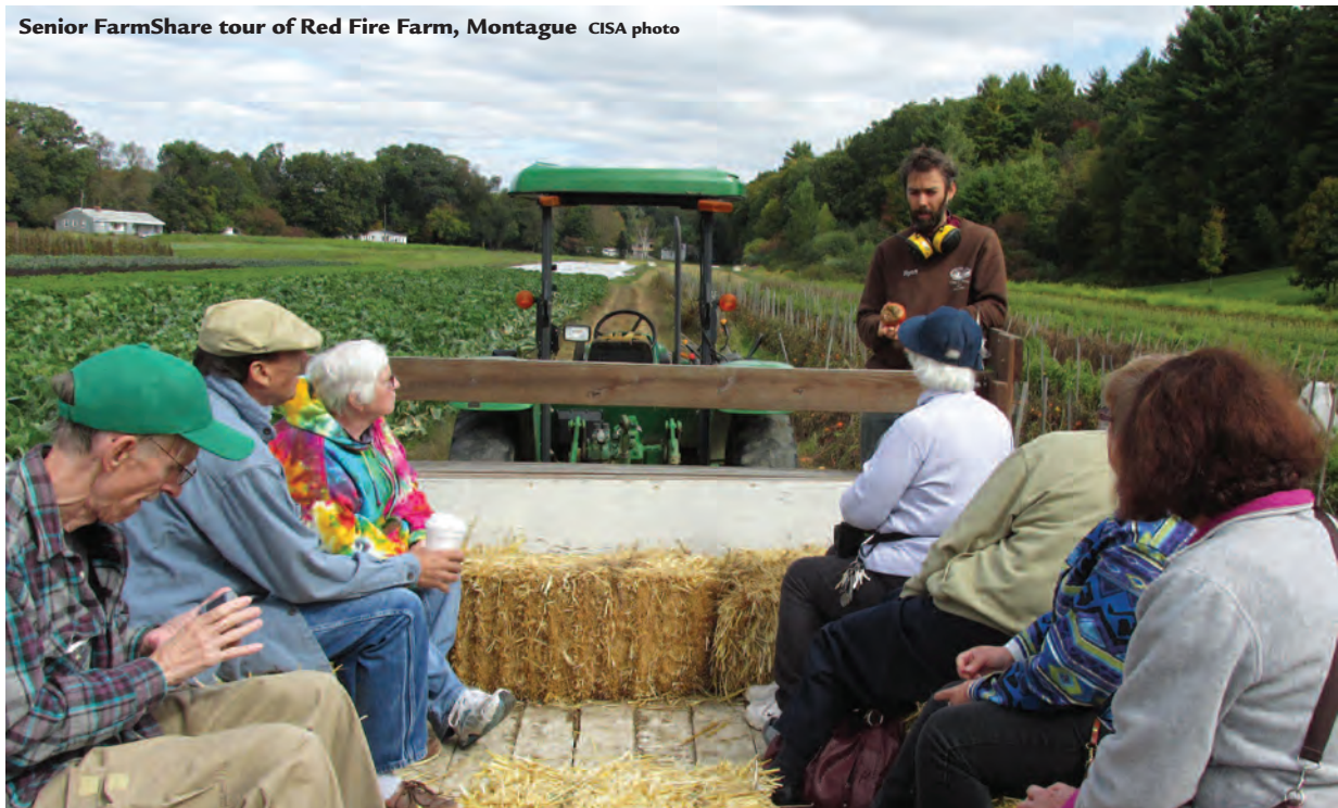
Senior FarmShare tour of Red Fire Farm, Montague