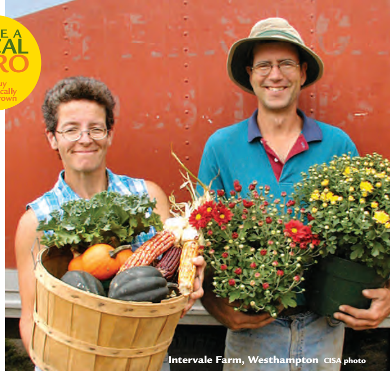
Intervale Farm, Westhampton

“People's tastes have changed a lot since we started farming. They're more interested in food and in having access to a variety of kinds of food,” Maureen