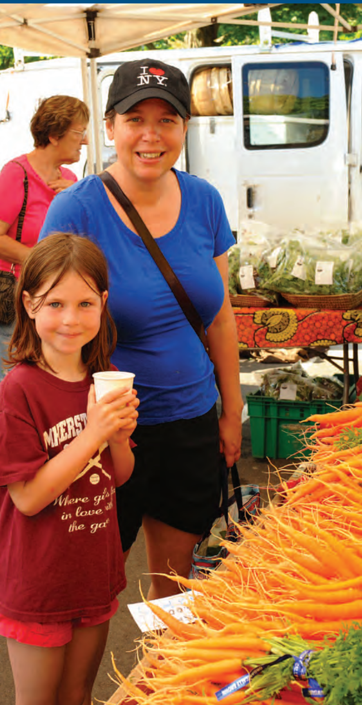
Amherst Farmers' Market