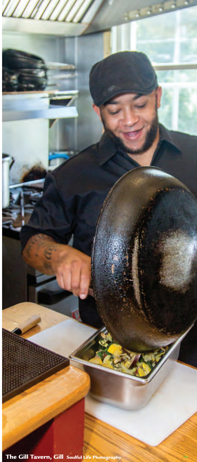
The Gill Tavern

Appalachian Naturals Artifact Cider Artisan Beverage Cooperative Black Birch Vineyard Blake Orchard Juicery Forest Products Associates I Can With, LLC Lashway Lumber Maple Valley Ice Cream Mi Tierra Tortillas Mother's, Inc Pioneer Valley Vinegar Works Ponders Hollow Custom Wood Flooring & Millwork Real Pickles Cooperative Relish the Harvest Richardson's Candy Kitchen Stoneman Brewery Tornado Firestarters, LLC