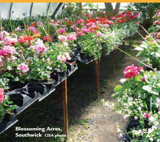
Blossoming Acres, Southwick

For more information please visit buylocalfood.org/support .