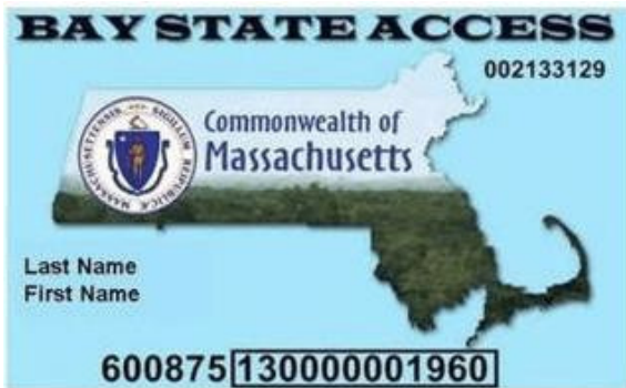
Old version EBT card (both are valid)

Name on card does not have to match the person using the card.